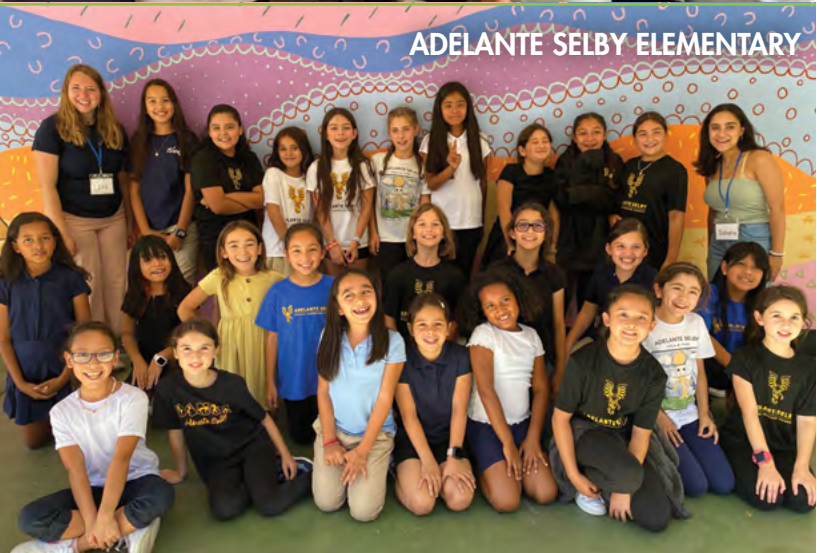
ADELANTE SELBY ELEMENTARY