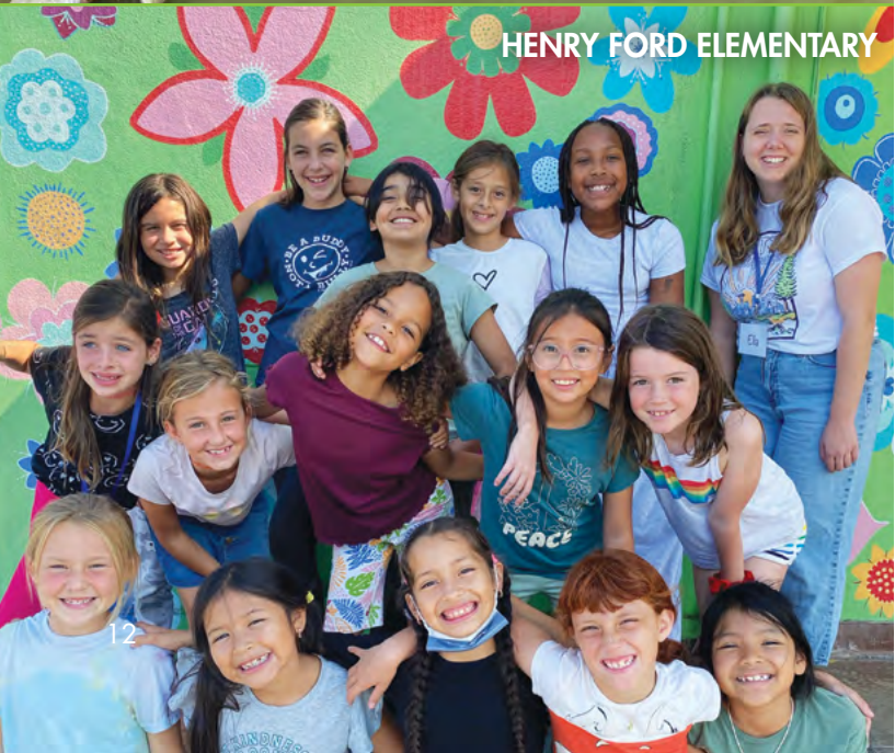
HENRY FORD ELEMENTARY

“Research suggests that the arts are a “spark”